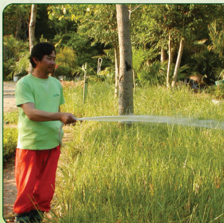
Nursery in Hong Kong