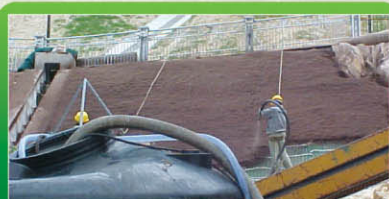
3 Spray a layer of 100mm thickness of fiber soil