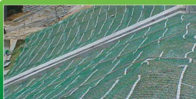
2 Lay and fix 2 layers of the 3-dimensional turf reinforcement mat