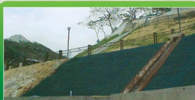
4 Lay and fix Geomat