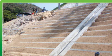
1 Shotcrete slope with 300mm topsoil