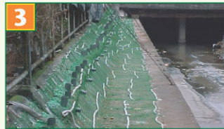
3 Fixing Turf Reinforcement Mat with fertilizer strip