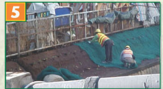
5 Fixing Geomat