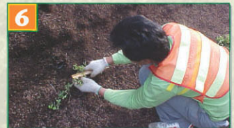
6 Planting of climber sprig