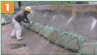
1 Fixing Eco-Bag in row type