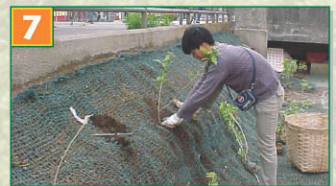
7 Planting of shrub on Eco-Bag