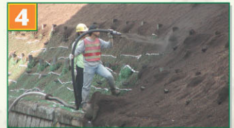
4 Spraying a layer of 70 mm Soil-Factor