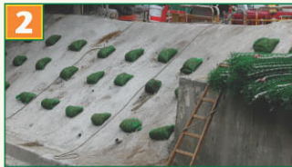
2 Fixing Eco-Bag in stagger type