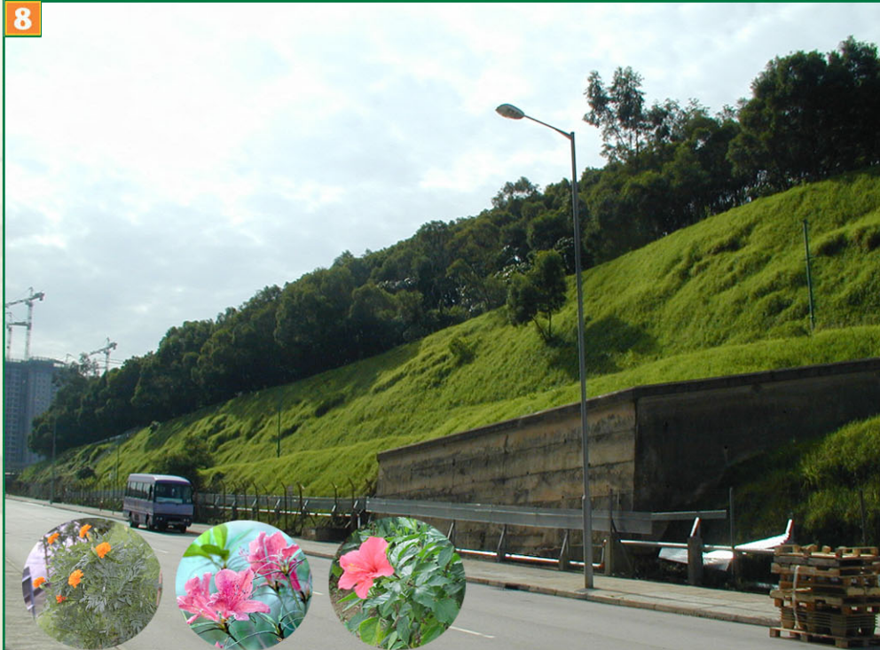
8 Completion of Work