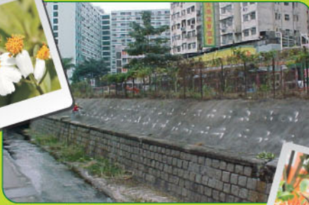
Before the Work