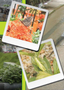
Establishment of Shrub Species